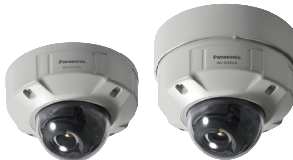
with Base Bracket